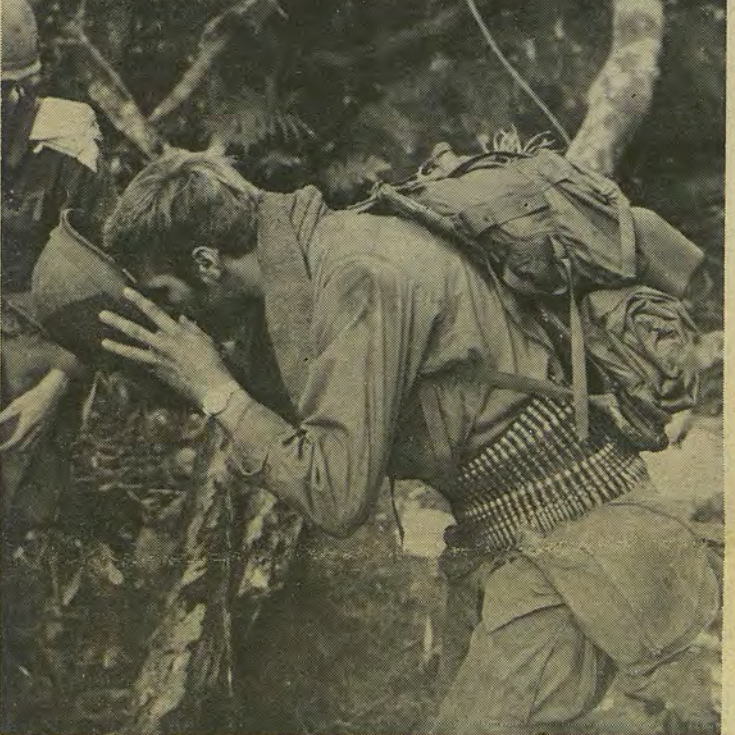
A COOL DRINK of water from a mountain stream provides a refreshing break for this soldier from the Famous 4th Division's Company D, 3rd Battalion, 8th Infantry.