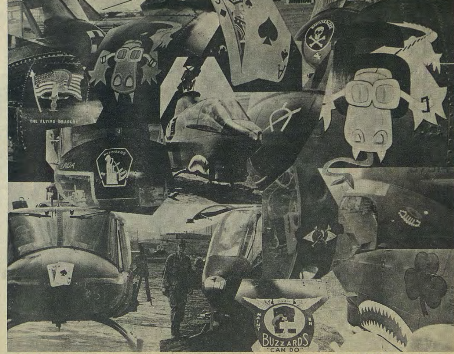
THE MANY FACES OF 4TH DIVISION AIR POWER ARE SEEN

The evacuation of the two Hoi Chans ended a successful 10-day period for the National Police of Kontum Province and added luster to the already glowing heritage of the 2nd Brigade's Panthers.