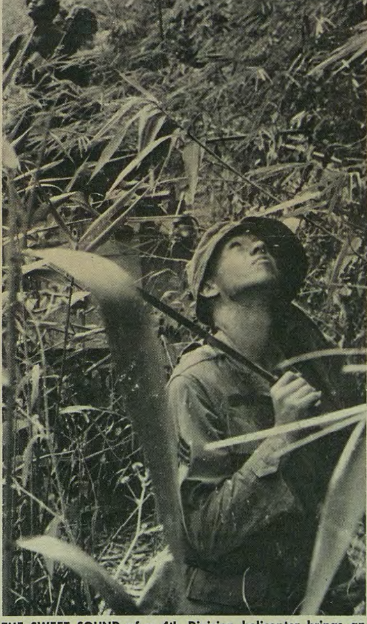
THE SWEET SOUND of a 4th Division helicopter brings an upward glance from these soldiers of the 2nd Squadron, 1st Cavalry as they work their way through heavy jungle.

filters." Normally the unit puts out 10,000 to 12,000 gallons of potable water to brigade units each day. Add to this the daily output of non-potable water and you get a total monthly output of 360,000 gallons. That's a staggering 2,988,000 pounds or 1,500 tons of water per month. Pound for pound, the water supply point is the brigade's mightiest supplier.